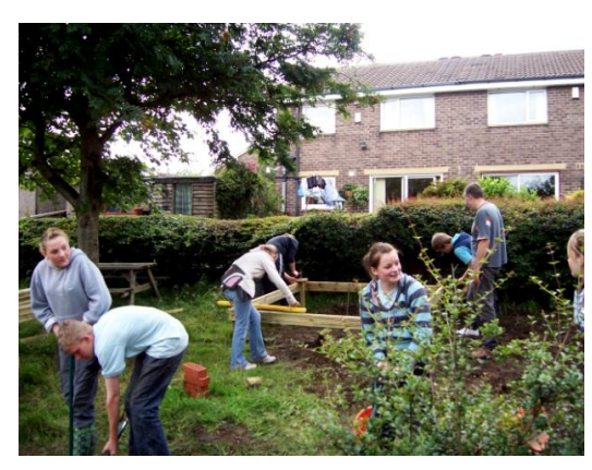
Allotment and Green Group